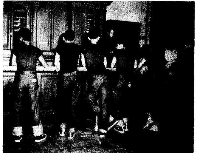
Upper left: Police and spectators stand near body of man slain outside a tavern. Police later captured a robber suspect who admitted the slaying occurred after an argument which started inside the tavern.