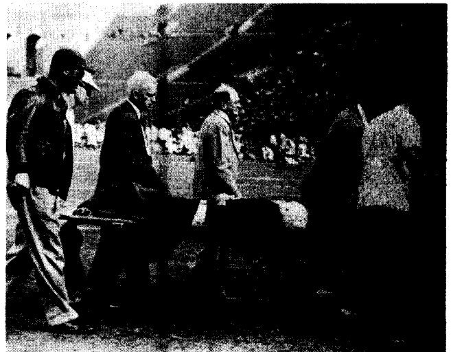
Lower right: Nationally known football quarterback is carried off the field after he received a back injury in a rough pro grid clash.